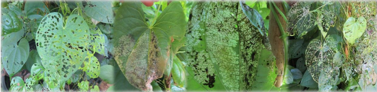
Figure 1. Air Potato Beetle Feeding Damage

How do you know if you have beetles on a site? This year it has been even more difficult than usual to identify incipient beetle populations. The reasons are two-fold, first the extended winter has caused the vines to sprout later than usual; most regions saw vines sprouting 2-3 weeks later than previously tracked years. Based on experience we have found that the beetles will not emerge from overwintering until roughly 4 weeks after the plant has begun to sprout; this therefore likely pushed natural air potato beetle emergence back to the beginning week(s) of June. When we couple this fact with the greater than normal rainfall during May we now have a situation where there are low populations of beetles later in the season which must be identified in an air potato vine infestation that has grown more rapidly. Needless to say, it can be hard to see small populations. The good news is with a normal generation time of about 1 month, we should expect larger, more apparent populations by mid-July. If beetles are still not seen at this time, then you may consider requesting additional beetles for release.