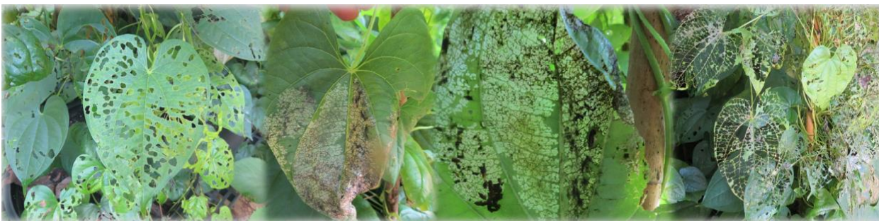
Figure 1. Air Potato Beetle Feeding Damage

How do you know if you have beetles on a site? This year it has been even more difficult than usual to identify incipient beetle populations. The reasons are two-fold, first the extended winter has caused the vines to sprout later than usual; most regions saw vines sprouting 2-3 weeks later than previously tracked years. Based on experience we have found that the beetles will not emerge from overwintering until roughly 4 weeks after the plant has begun to sprout; this therefore likely pushed natural air potato beetle emergence back to the beginning week(s) of June. When we couple this fact with the greater than normal rainfall during May we now have a situation where there are low populations of beetles later in the season which must be identified in an air potato vine infestation that has grown more rapidly. Needless to say, it can be hard to see small populations. The good news is with a normal generation time of about 1 month, we should expect larger, more apparent populations by mid-July. If beetles are still not seen at this time, then you may consider requesting additional beetles for release.